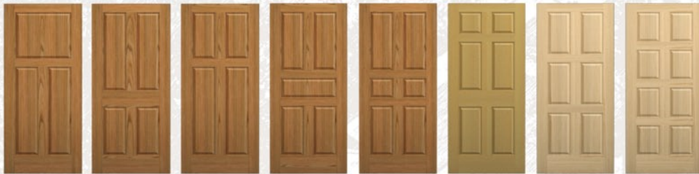
K-5320 K-5400 K-5410 K-5500 K-5600 K-5610 K-5660 K-5810