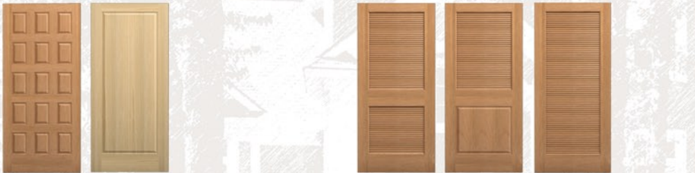
K-5930 K-6000 K-7300 K-7320 K-7330