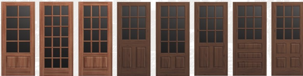
K-3580 K-3600 K-3700 K-3750 K-3800 K-3820 K-3830 K-3840