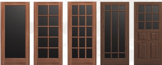
K-6010 K-6020 K-6080 K-6090 K-6510