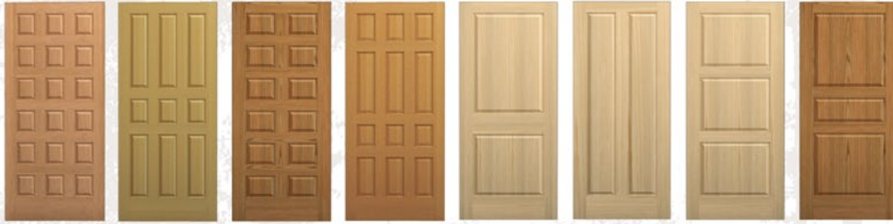
K-3180 K-3190 K-3220 K-3320 K-4010 K-5020 K-5300 K-5310