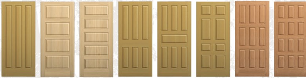
K-3030 K-3040 K-3050 K-3060 K-3070 K-3080 K-3090 K-3120